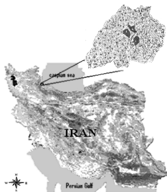
Fig. 1. The map of the study area

in practice as well in the majority of scientific forestry projects in northern forests of Iran. However, the selection method has been implemented in practice during the last decade. For this study, Compartments No. 35 and 23 were selected that are situated in District 1 and 2 Nav, Asalem forest, which is located in the north of Iran (Fig. 1). Brief general properties of the two studied compartments are shown in Table 1. Methods of harvesting in these compartments (No. 35 and 23) were selection and shelterwood, respectively, and there have not been any operational activities in these two compartments since 10 and 20 years ago. The longest skid trail was selected in each compartment. The length of the skid trail for shelterwood and selection method was 850 and 650 m, respectively. The average longitudinal slope of skid trails was approximately 20%. In logging methods, manual felling (chain saw) and wheeled skidder were used for wood extraction. The other ecological conditions of the studied area were the same. For this investigation, three classes of traffic were identified in each skid trail. The class High was the part of the skid trail close to the landing which had the highest traffic, the class Medium with an intermediate distance to the landing which had a medium traffic, and fi-